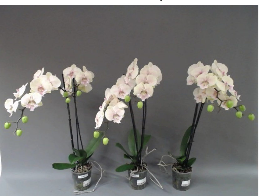
488. Consumer simulation day number 77