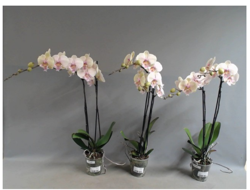
488. Consumer simulation day number 0