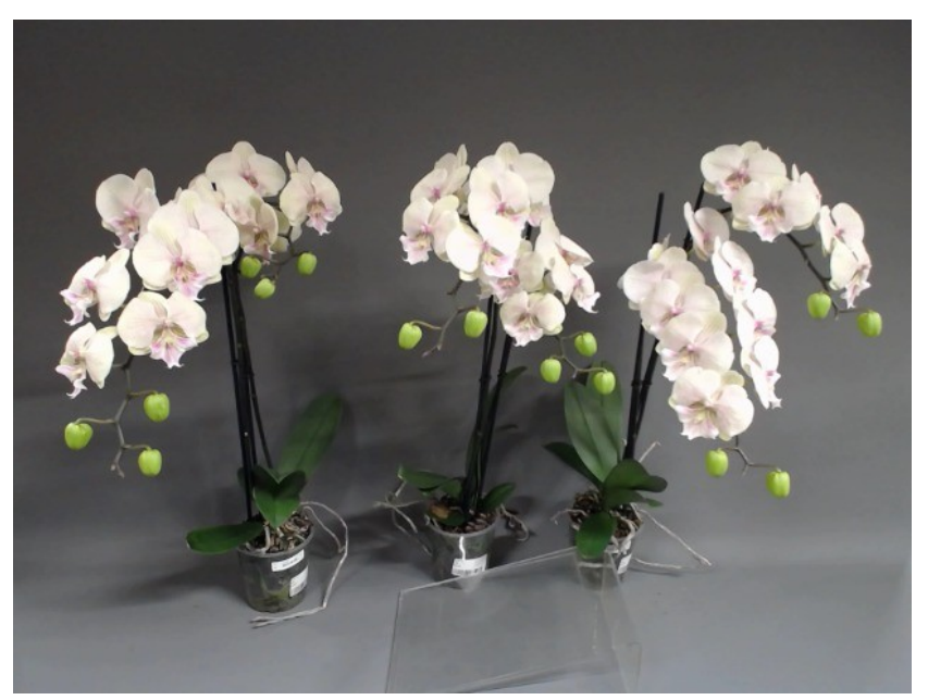
488. Consumer simulation day number 70