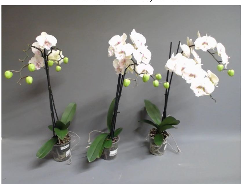
488. Consumer simulation day number 105