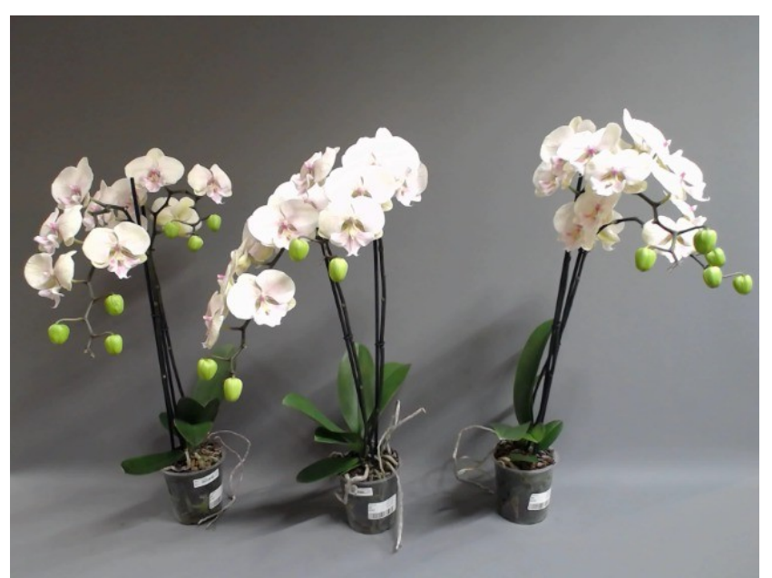
488. Consumer simulation day number 91