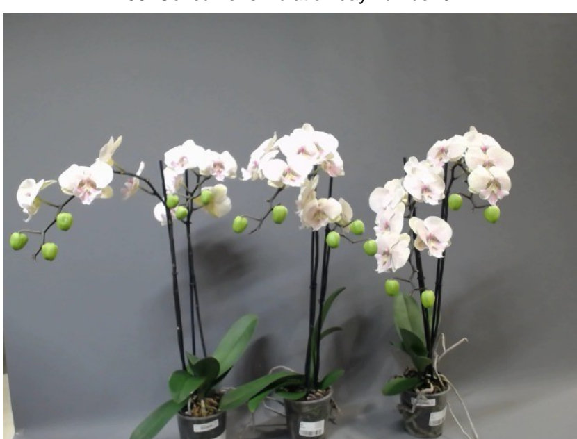
488. Consumer simulation day number 98