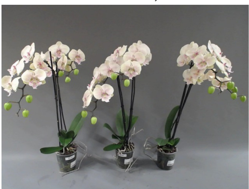
488. Consumer simulation day number 84